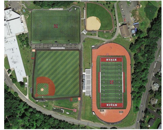
Nyack Public Schools Athletic Facilities

Through extensive site and athletic facility master planning services, The LA Group helped the district develop $7.6M in athletic facility upgrades. In-depth analysis of athletic field usage, synthetic turf vs. natural grass fields, and health and safety aspects were instrumental in the success of the referendum. The project includes a new synthetic turf soccer/lacrosse field and natural grass softball field, a synthetic turf baseball/field hockey field, reconstructed running track from 6 to 8 lanes with new synthetic turf multi-purpose field, bleachers, press box, and concessions building. Other improvements included the reconstruction of tennis courts. Awarded 2020 Best High School Sports Venue in the Lower Hudson Valley by Rockland/Westchester Journal News.