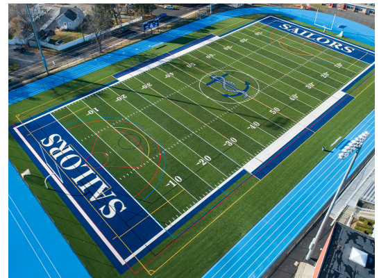
Hendrick Hudson CSD Stadium