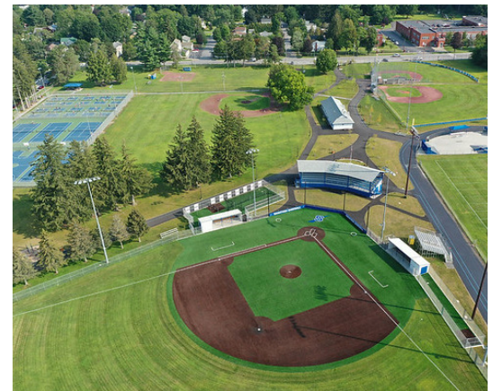
Saratoga Springs CSD Great Outdoors Project

The LA Group collaborated with stakeholders on the reimagining of the 20-acre, district owned Eastside Recreational Park. The district shares the park with the many city recreation and youth sports programs. Significant improvements were made for all ages to enjoy including a new field house; a synthetic turf baseball infield with new dugouts and rehabilitated grandstand; new lit tennis and basketball courts; the first designated pickleball courts in the city; reconstructed handball courts; a fitness trail that includes the former running track with fitness station; associated pavilion; and new park entrances with directory signs, walkways, site lighting and furnishings. Lighting was also added to a little league baseball field in the park. The project also included synthetic turf multi-sport field and irrigation improvements of the high school.