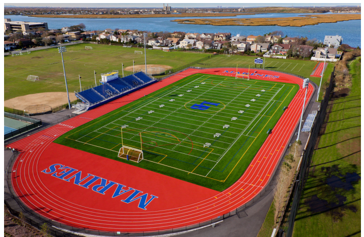
Long Beach City Schools, NY