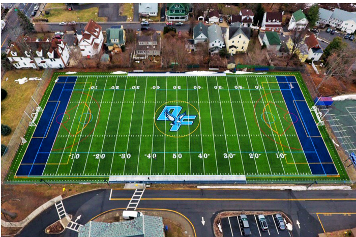
Dobbs Ferry Union Free School District, NY