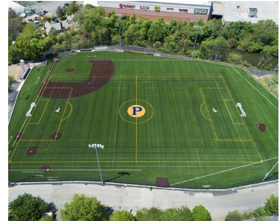
Pelham CSD Glover Field Complex

The LA Group together with the project architect worked with the Pelham UFSD to shepherd a project from bond referendum to ribbon cutting. The referendum included a special proposition devoting $4.6M to athletic facilities improvements to reconstruct their four existing tennis courts and provide a multi-use synthetic turf facility. The existing natural grass fields, now converted to synthetic turf, were previously heavily used by the school district and community recreational groups. Now as a lighted field with an all-weather surface designed for baseball, softball, soccer, football, lacrosse, field hockey, and rugby, the facility is a major improvement that will increase practice and competition time available for the whole community.