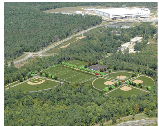
Luther Forest Technology Campus Athletic Fields

Continuing a long relationship The LA Group collaborated with the Town of Malta, community residents, and recreation organizations, a master plan of 33 acres was developed for the site that includes multi-sized soccer fields, softball fields, concession facilities, adequate parking, a comfort station, gazebos and covered shelters, walkways and pedestrian connections, and a playground facility. Future implementation projects, now underway, to complete the master plan include additional softball fields, expanded soccer facilities, a playground facility, and additional walkways and pedestrian connections.