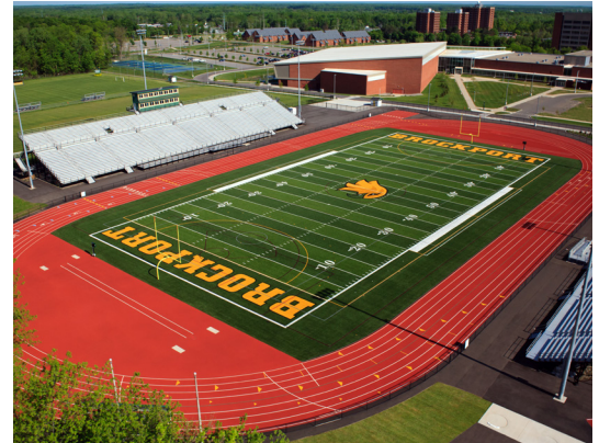
SUNY Brockport E.K. Shriver Stadium