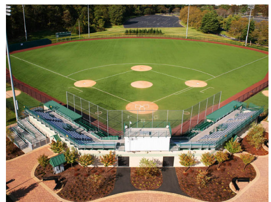
SUNY Farmingdale Baseball Field