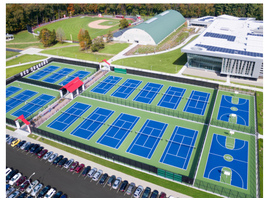
SUNY Cortland Tennis and Basketball Courts