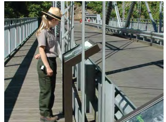
New River Gorge, WV