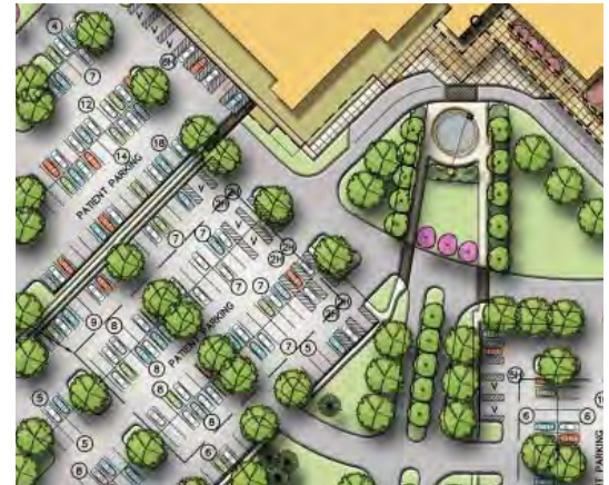
Eugene CBOPC Peer Review, OR (VA)