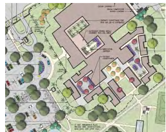
San Juan Inpatient Mental Health Facility, PR (VA)