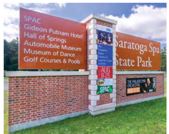
Saratoga Spa State Park Signage Plan, NY (NYSOPRHP)