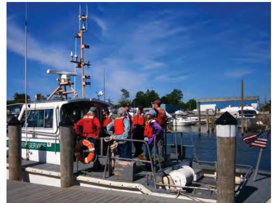
Sailors Haven, Fire Island National Seashore, NY (NPS)