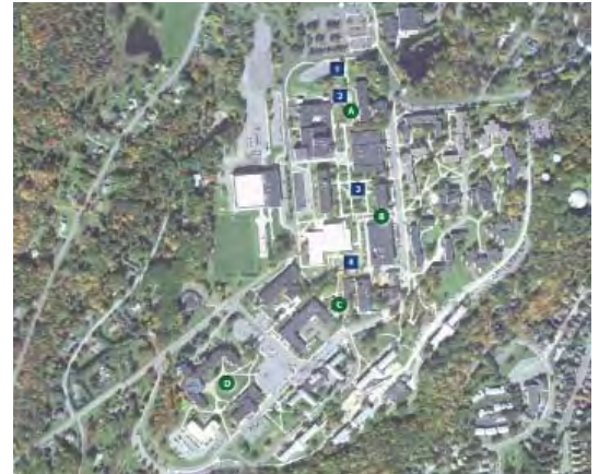
SUNY Oneonta (SUNY)