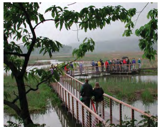
Constitution Marsh Sanctuary, NY (NYSOPRHP)