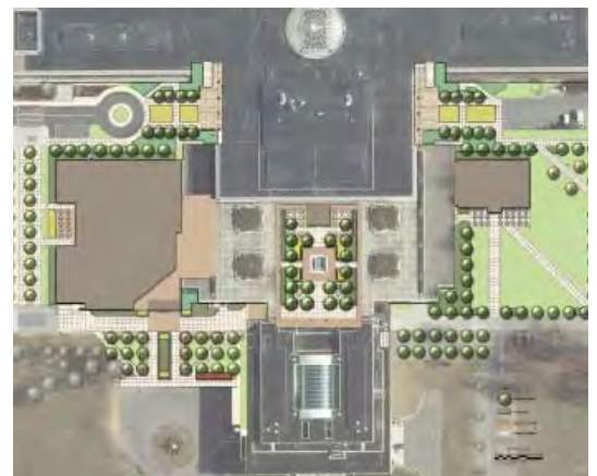
SUNY Albany (SUNY)