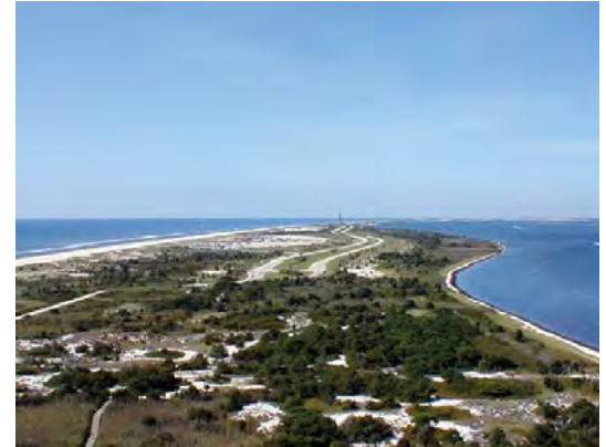
Fire Island National Seashore, NY (NPS)

Planning Services, Northeastern Region The LA Group (Prime) Contract# C4565010002 8/21/01 – 8/28/06 5-yr/$1M