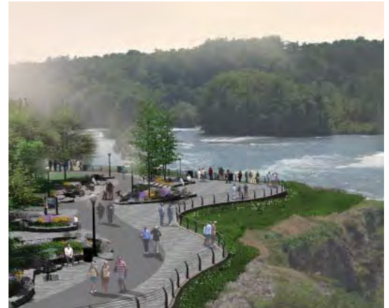
Niagara Falls, NY