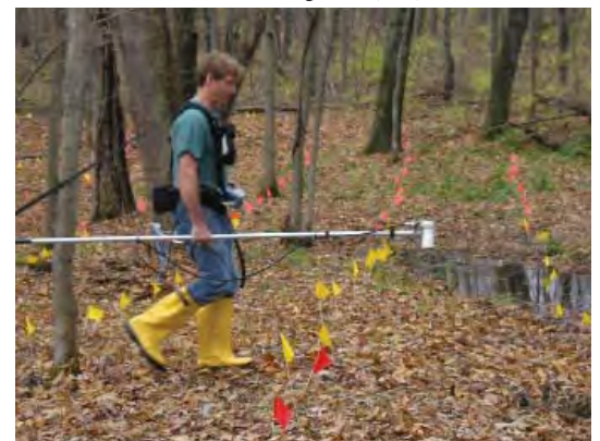
Victory Woods Wetland Delineation, NY (NPS)