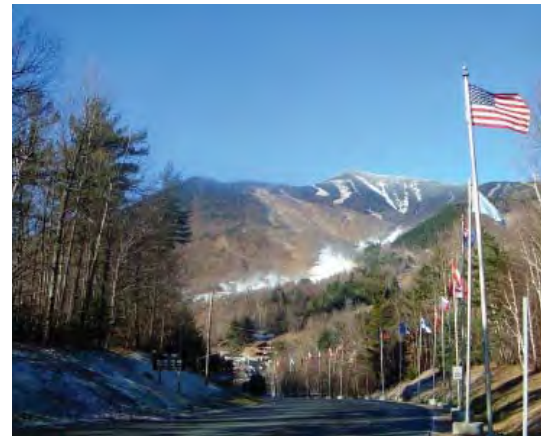
Whiteface Mountain Ski Center, NY (NYORDA)