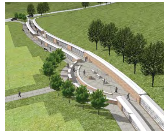
National Cemetery of the Alleghenies, Bridgeville, PA (VA)