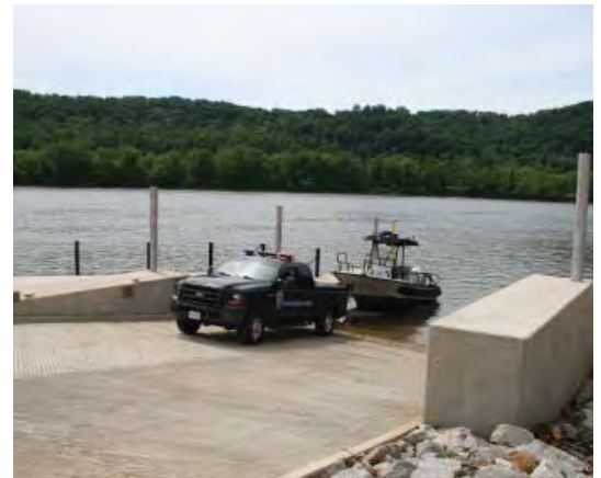
Wayne National Forest Frontier Boat Launch, OH

The LA Group, Landscape Architecture and Engineering, P.C.